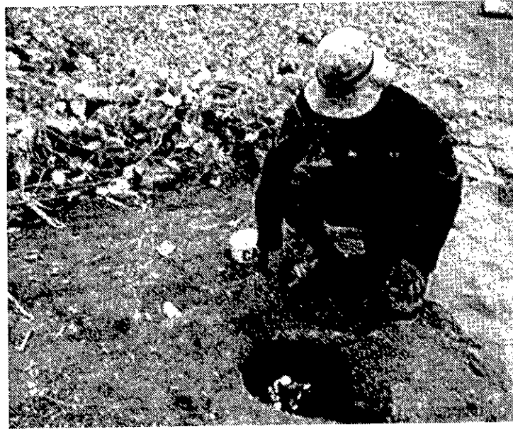
Turtle encounter. Chevron staff and security personnel have learned how to properly respond, handle and protect the sea turtles.

With the sea turtle population dwindling due to predation and exploitation, the Department of Environment and Natural Resources (DENR) has been lobbying for the